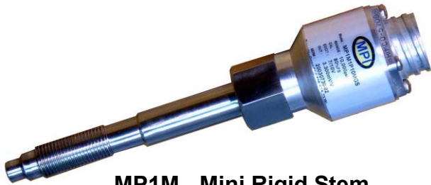
MP1M - Mini Rigid Stem